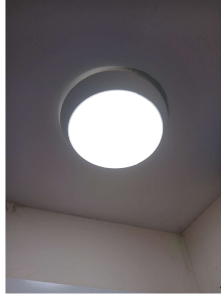
Lighting (Standard and Emergency Lights)