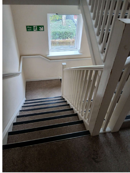
Hallway (Communal Lobbies and Stairs)