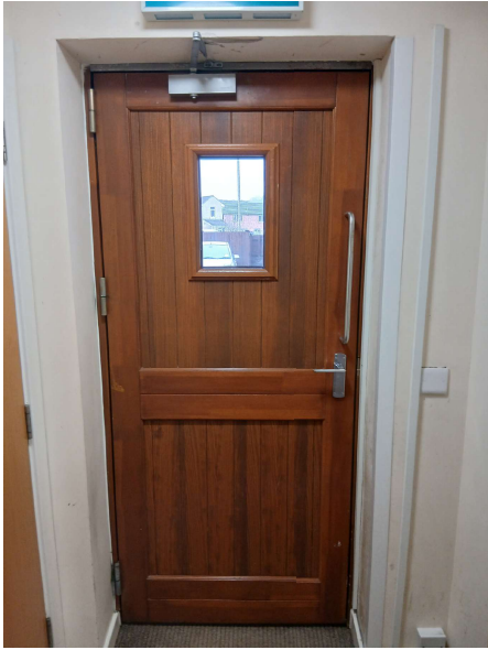
Entrances (Main Doors)