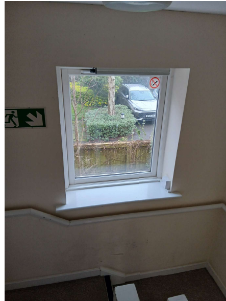
Windows (Communal Windows)