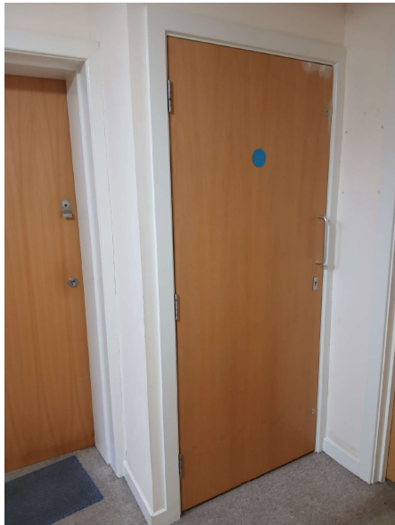
Cupboard Doors (Electrical Cupboard Doors)